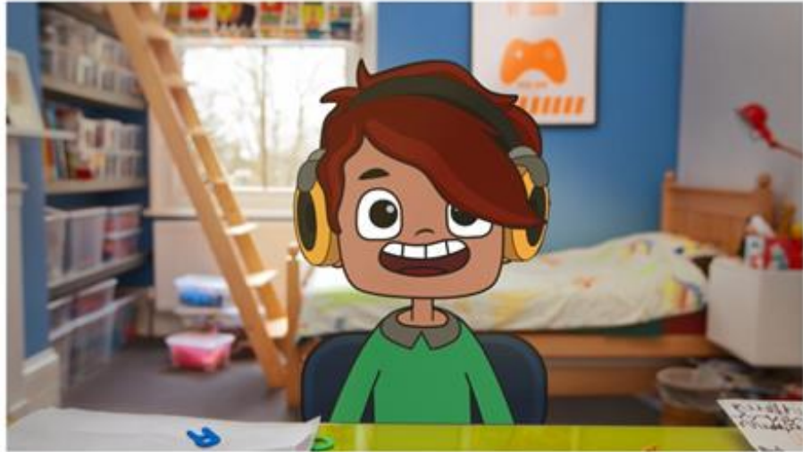
Tips&Tricks to beat the boss